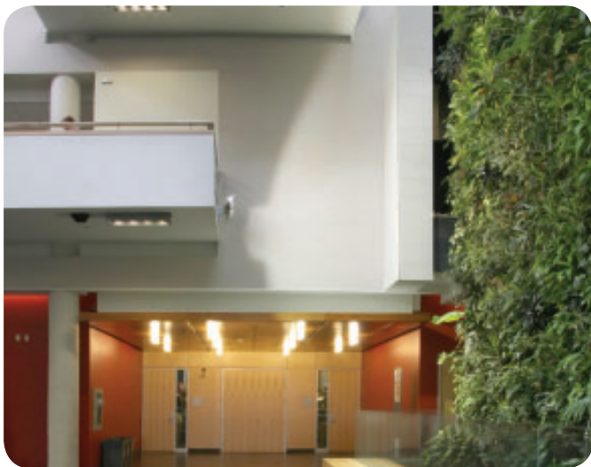
Figure 1 The living wall at the University of Guelph contains over 1000 plant species.

You walk into one of the many tall buildings in the “concrete jungle” of a typical urban centre. As you enter, you hear cascading water, feel and smell the cool, fresh air, and then you see a green wall. Are those plants growing up the wall? Welcome to the world of living walls (Figure 1)!